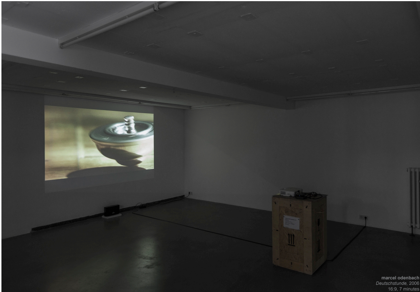
marcel odenbach Deutschstunde , 2006 16:9, 7 minutes