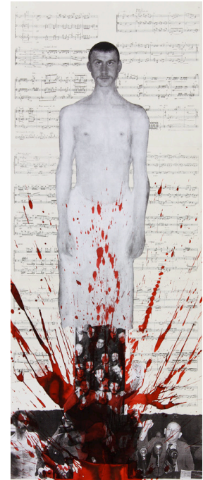
marcel odenbach Verklärte Welten , 2012/13 collage, photocopies, transparent paper, aquarell, colored pencils and ink on paper 89,3 x 36 cm (parts 1 & 3 each) 36 x 96 cm (part 2)

© VG Bild-Kunst, Bonn 2016