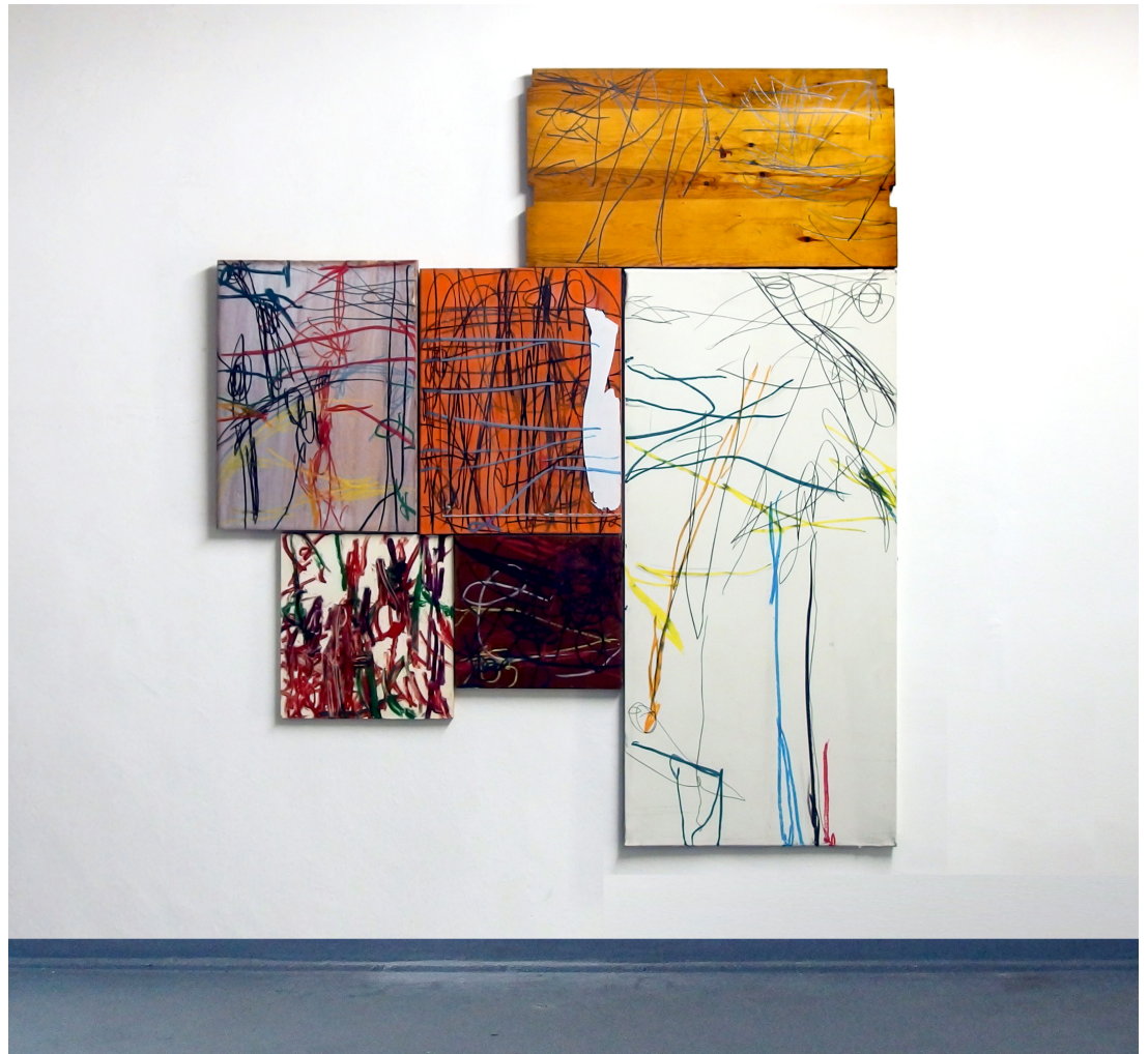
boaz kaizman O.T., 2015 168 x 146 cm mixed media